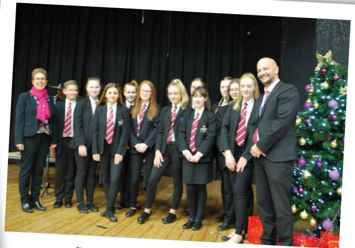
Our top 10 in Year 8