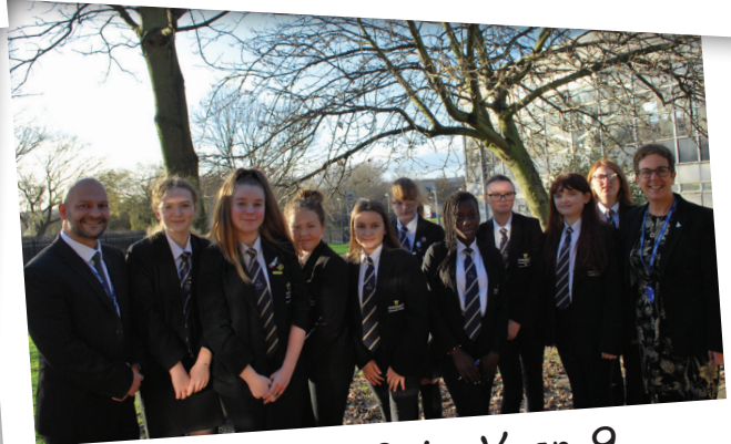
Our top 10 in Year 9