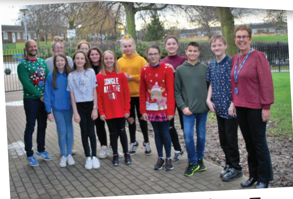
Our top 10 in Year 7