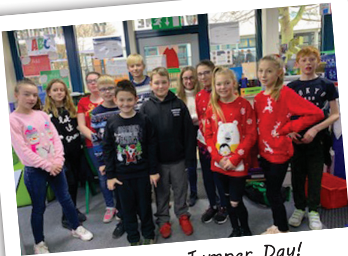
Christmas Jumper Day!